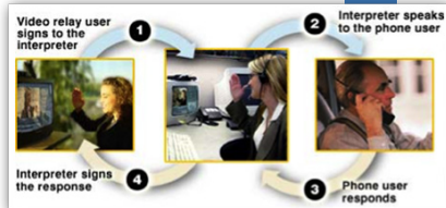
From TAP at Gallaudet

VRS allows people who know sign language to call anyone who can hear but does not know sign language with the assistance of a sign language interpreter. VRS is a telephone service through which callers can see and hear each other. Many in the deaf community have a videophone, so they can communicate directly with another deaf individual who has a videophone. Some VRS providers install a device in the home that connects to a television set and serves as a videophone. Families can contact a VRS provider to obtain this equipment for their child. A new FCC ruling now allows hearing people who can sign fluently to obtain a videophone number of their own to call directly with deaf signers without having to use VRS.