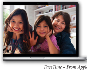
FaceTime – From Apple

Many mobile apps can provide functional equivalency in communication without using the relay service.