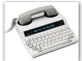
A more recent model of a TTY from Ultratec.

The first device that allowed people who are D/HH to use the telephone was the TTY —